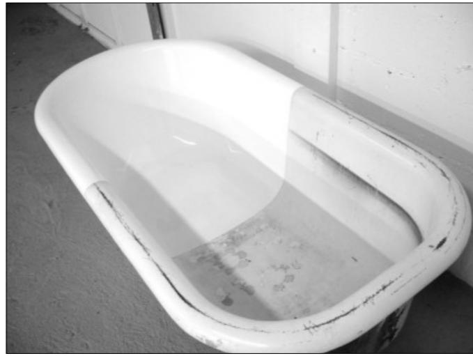
A claw foot tub (above) awaits re-glazing at Unique Refinishers.

"Originally, the outsides of the tubs were black, raw cast iron," said Kott. "Everyone painted the outside what color they wanted and only the inside was white porcelain. Generally, they painted