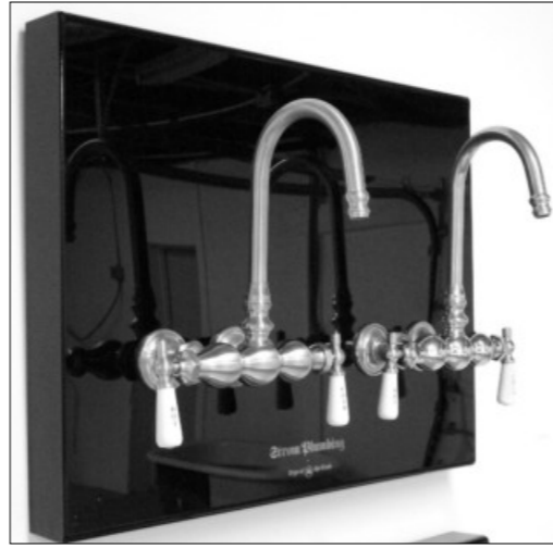
Antique-styled faucets and hardware (left) are part of the Unique Refinishers stock.

the bathroom whatever they painted on the outside of the tub. But we can do any color."